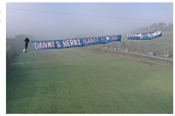
Image is of a 300 metre traverse tied from Dannenröder to Herrenwald, forest to forest across the Glental river and blocking for days the B62 regional road. I and a comrade had the pleasure of occupying the 20 metre high anchor point hammocks, in the crown of the tree on the Danni side overnight. We pulled up delivered forest clay oven made calzones and listened to the party that night made out of the closed road below.

That night as I was carrying reclaimed material from the fallen tree-houses out of Herri to the Mawa , I was met by another reinforcing surprise, some of my favourite forest people, the FLINTA*<sup>23</sup> crew, showed up. 5 of those associated with the queer-feminist barrio Zukunft 'Future', all with backpacks ready for reoccupation and resilience. Relieved as I was that the cops had fucked off back to their hotels, (sadly not homes and therapy), we orientated ourselves back into the forest to scout a stand of trees that made sense to reconstruct and pull platforms up into. As people got immediately to work, I then laid myself on a mat on the forest floor to rest for a moment, and passed out.